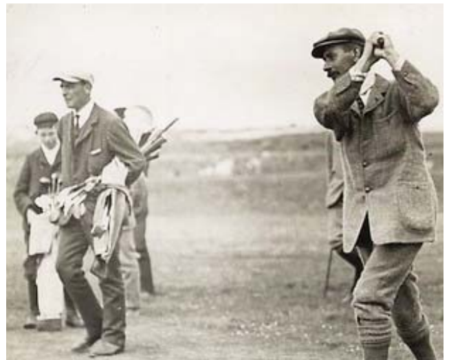
● Harry Vardon six times Open Champion

The subsequent decades saw two World Wars, new clubhouses and a new layout on land that was now owned by the Crown. The Club recently negotiated a new, long-term lease with the Crown for the courses to secure its heritage for many years to come.